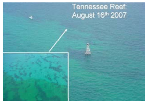
J. Fajans, Keys Marine Lab

Indicators are ecosystem components that can be monitored to measure change and reflect the condition of the ecosystem. They must be present throughout the coastal system and be a key attribute or effect in the ICEM. Indicators must also integrate the system-wide response to various ecosystem drivers. One example of a QEI is algal bloom status in Florida Bay. The concentration, duration and spatial extent of chlorophyll a with respect to historical conditions assesses changes in the habitat. (Right: Image of Tennessee Reef with algal bloom moving from Florida Bay to the Florida Keys reef tract.)